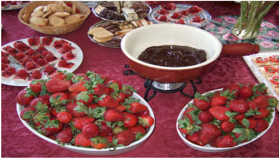
Mmmmmmm! Strawberries AND chocolate!